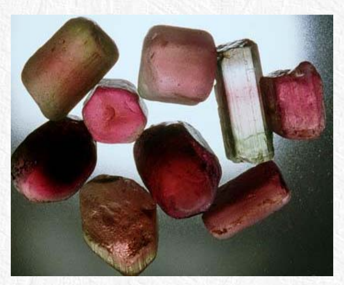
Tourmaline crystals from the Ibadan gemfield

In the summer of 1998 a new tourmaline deposit was discovered in a farming area 25 miles from the city of Ibadan, Nigeria, near the border with Benin. Gem dealers have noted that this is one of the finest discoveries of tourmaline in many years. The deposit is alluvial in nature, many of the tourmaline crystals have a frosted skin resulting from natural abrasion and weathering. Other crystals have sharp terminations indicating that they have not traveled far from their original source. The crystals were found under a relatively shallow overburden of soil (about six feet), and the deposit stretched for about 1000 meters. A flood of miners rapidly moved into the area and removed over 1,000 kilograms of fine tourmaline. The worn tourmaline crystals show very good clarity and range in color from pale pink, to raspberry pink, to orangish pink, to burgundy red. Some of the crystals show distinct color zoning (See Above). The fashionable colors, combined with the remarkable clarity and size of the rough gem material, have made this tourmaline a hit with gemstone dealers and the public. Because of the large supply of material, average prices for faceted stones at the 1998 Tucson gem and mineral shows were as low as $60 to $100 per carat. Because this source is largely worked out, the depressed price of these fine tourmalines is not likely to persist.